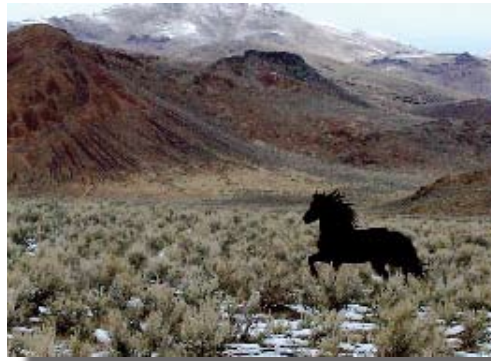
photo by Craig Downer, 2010 "Freedom," Calico Complex stallion that regained his freedom by vaulting six-foot panels and crashing through barbed wire.