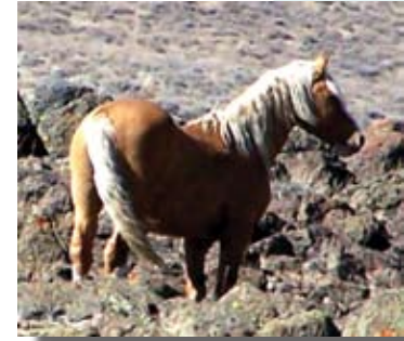
Calico Complex, 2009